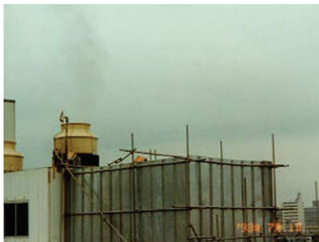
Figure 1. Spraying scenes from the Aum Shinrikyo headquarters building (photographs taken July 1, 1993, by the Department of Environment, Koto-ward).

other syndromes caused by the anthrax bacillus, since the true nature of the mist was not recognized. Reports of short-term loss of appetite, nausea, and vomiting (symptoms not typical of B. anthracis infection) among some residents were the only contemporary evidence of human illness associated with the incident. Vague reports of illness in birds and pets were also noted in local media (1), but the exact nature of these illnesses remained unclear.