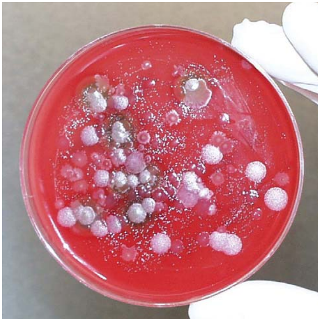
Figure 2. Fluid collected from the Kameido site cultured on Petri dishes to identify potential Bacillus anthracis isolates.

tory illnesses, or hemorrhagic meningitis, which is often a complication of systemic anthrax (5,6) in residents of the high-risk area.