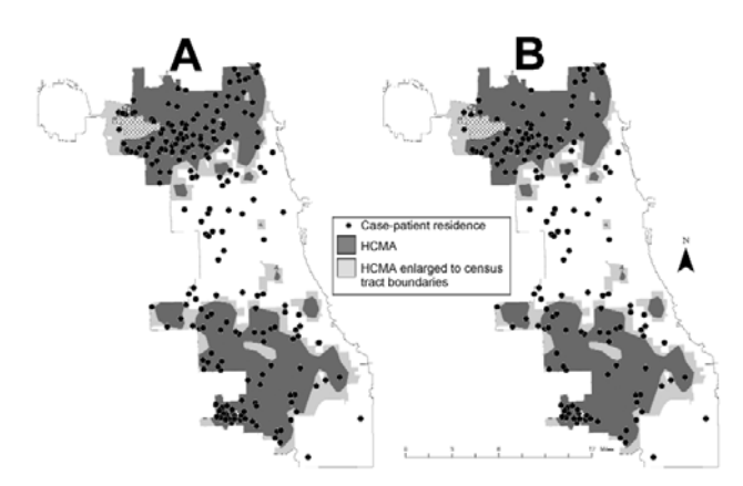
Figure 2. Chicago map with high crow-mortality areas (HCMAs) and reported residences of A) West Nile virus (WNV)-infected case-patients, or B) WNV meningoencephalitis case-patients (WNV fever cases excluded), 2002.

We identified a spatial association between early-season crow deaths and residences of WNV-infected casepatients in Chicago. The findings indicate that a