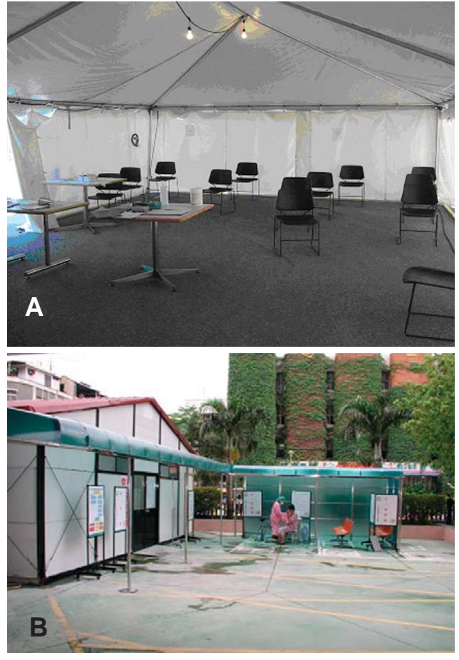
Figure 2. A, evaluation center for severe acute respiratory syndrome (SARS) in Toronto, demonstrating spatial separation of chairs in waiting area intended to reduce patient-to-patient transmission. B, evaluation center for SARS in Taiwan, demonstrating triage screening of a patient by a healthcare worker wearing personal protective equipment.

gency department with a febrile respiratory illness might have SARS and might transmit infection to other patients. In response, officials either constructed or retrofitted existing facilities to create SARS evaluation centers (i.e., "Fever Clinics") (13). These units were designed to safely assess large numbers of people while minimizing the risk for SARS transmission, and in fact in both Toronto and Taiwan, no transmission was reported in these facilities. Staff and patients were grouped into cohorts, and a space of >l m was allocated between patients to make direct contact and droplet transmission less likely. Dedicated entrances and exits and clearly marked patient pathways were provided to segregate patients under evaluation. Provisions were made to ensure adequate ventilation and air exhaust to reduce the risk for droplet or airborne transmission. In Taiwan, temporary structures with high efficiency filtration were built (Figure 2). In Toronto, both tents and existing facilities were used.