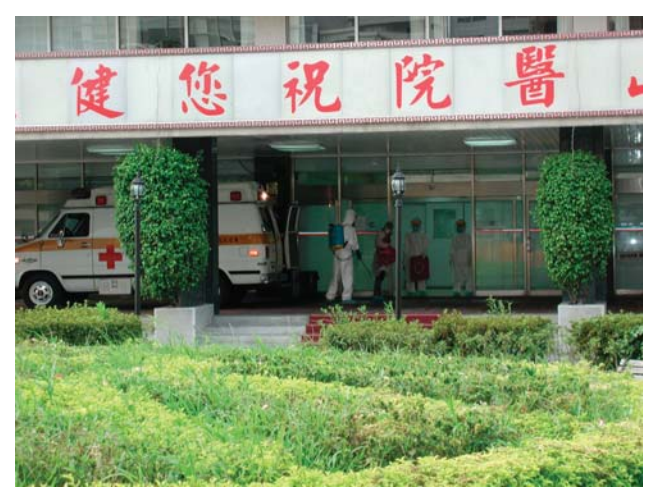
Figure 2. Hospital worker in full personal protective equipment disinfects ambulance and hospital at Song Shan Hospital after delivery of a suspected severe acute respiratory syndrome patient, June 2003.

recirculation) dedicated exhaust systems. Exhaust air in all hospitals was treated with HEPA filtration and UVGI before discharge. Visual indicators at the IR door and a remote indicator panel in the nurses' station monitored isolation room pressure. Isolation design included a pressure gradient from the clean (e.g., nurses' station or change room) to the less clean (patient room), including buffer zones to achieve the desired conditions (Figure 3). Designated laundry and medical waste corridors were established, and aggressive cleaning regimens were implemented to ensure frequent sanitation of all areas, including twice daily cleaning of patient rooms and autoclaving of waste before its removal from the facility. Personal protective equipment requirements varied somewhat among hospitals, but typically healthcare workers wore an N95 or