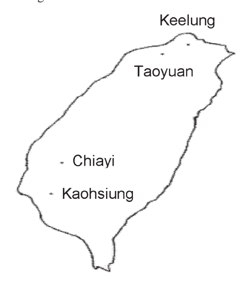
Figure 1. Geographic position of the four hospitals in Taiwan where Salmonella enterica Choleraesuis isolates were collected and surveyed for their susceptibility to ciprofloxacin, 2000–2003.

ciprofloxacin of the isolates was investigated by a standard