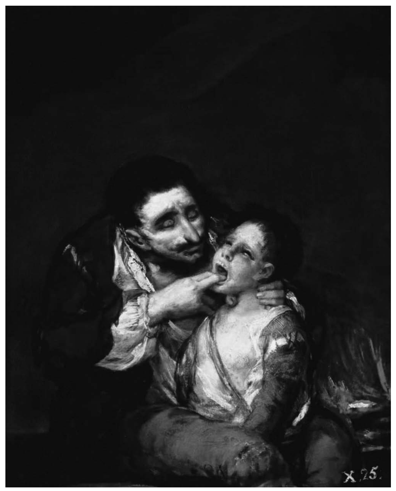
Figure. Francisco José de Goya y Lucientes (1746–1828). Lazarillo de Tormes (1819). Oil on canvas. Private Collection