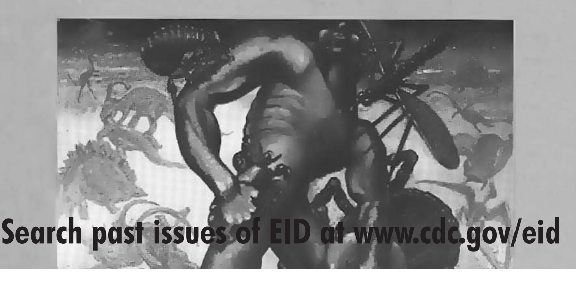
Emerging Infectious Diseases • www.cdc.gov/eid • Vol. 11, No. 1, January 2005