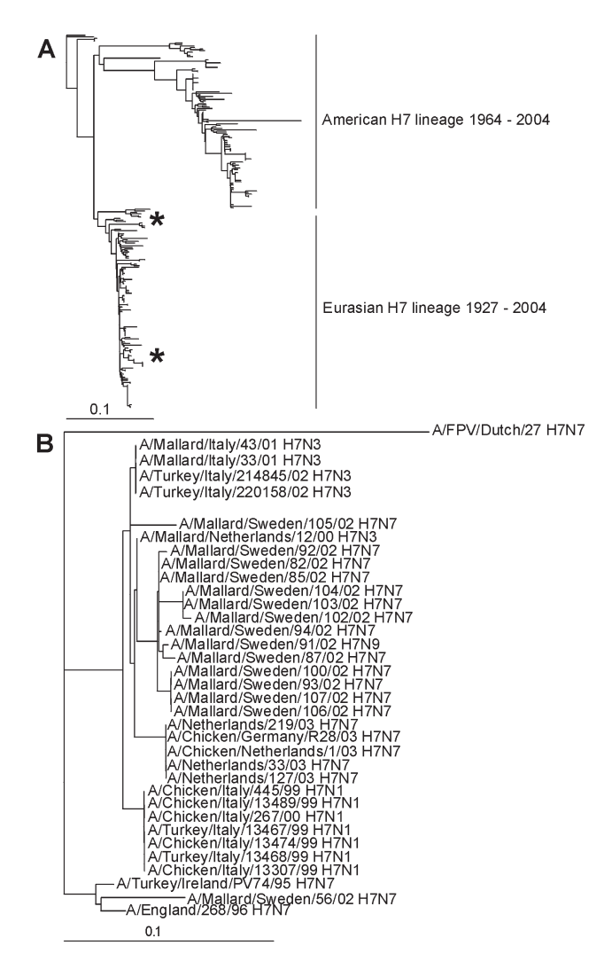
Figure 2. Phylogenetic trees of hemagglutinin H7 sequences. A) Phylogenetic tree based on the amino acid sequence distance matrix for the HA1 open reading frames of all H7 sequences available from public databases. The scale bar represents ≈10% of amino acid changes between close relatives. *Represents the locations of the Mallard influenza A virus isolates. B) DNA maximum likelihood tree for the European highly pathogenic avian influenza A viruses and the low pathogenic avian influenza H7 influenza A viruses isolated from migrating Mallards by using A/FPV/Dutch/27 as outgroup. The scale bar represents 10% of nucleotide changes between close relatives.

rabbit antisera. The hyperimmune rabbit antisera were chosen on the basis of their ability to provide a broad response, which would recognize a wide range of strains within 1 subtype, whereas the postinfection ferret antisera were chosen on the basis of high specificity. HI assays showed that the antigenic properties of the H7 influenza A viruses from Mallards were relatively conserved, and that the HI data for the Mallard influenza A viruses did not differ significantly (i.e, up to 4-fold) from those obtained with