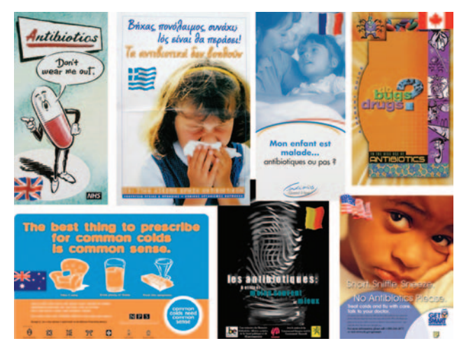
Figure 1. Posters from nationwide educational campaigns against misuse of antimicrobial drugs.

ing results from countries with high prevalence of pneumococcal resistance such as Israel, France, Spain, and the United States, this vaccine will likely reduce the incidence of invasive disease due to resistant pneumococci (22,24). Further progress in pneumococcal vaccine development can be expected from conjugate vaccines that include more than 7 serotypes (25). Yet uncertainty remains regarding serotype replacement and the emergence of resistance in nonvaccine serotypes (25).