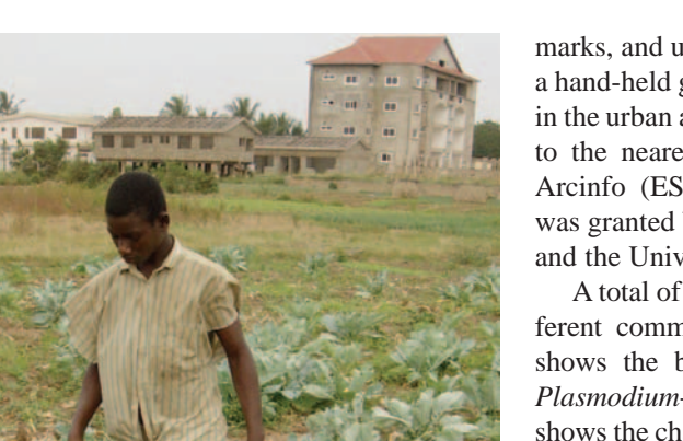
Figure 2. Commercial irrigated vegetable production in urban Accra, Ghana.

type of urban agriculture, which refers to irrigated, openspaced, commercial vegetable production.