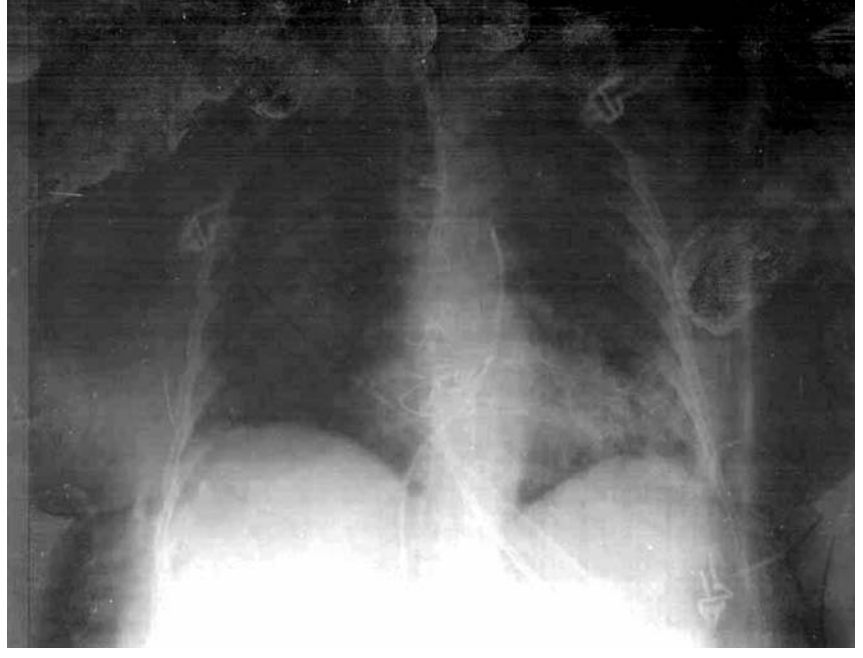
Figure. Chest radiograph of the patient showing bilateral alveolar infiltrates. Although pulmonary edema was the initial diagnosis, an infectious cause should be considered and, on the basis of sepsis, appropriate treatment initiated.

On direct examination, a Gram stain of the protected specimen brush sample showed numerous gram-positive bacilli. After incubation for 48 h in either an aerobic or capnophilic atmosphere, >1,000 CFU/mL were observed on Columbia agar plates containing 5% sheep blood (BD Stacker Plates, BBL, Franklin Lakes,