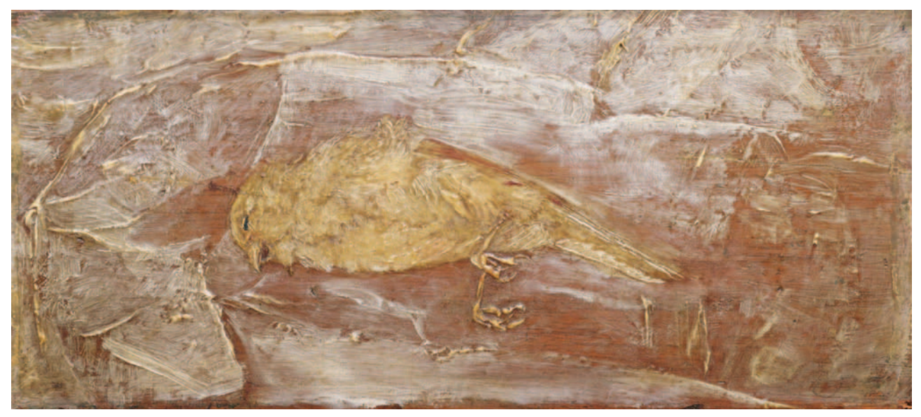
Dead Bird, by the influential 19th-century American artist Albert Pinkham Ryder (1847–1917), was first seen by Duncan Phillips no later than 1916 but was not purchased for the collection until it became available a decade later. The major scholarly catalog of The Phillips Collection, The Eye of Duncan Phillips: a Collection in the Making (1), calls Dead Bird "one of Ryder's most powerful images," noting that it "explores a recurrent illusory theme: the coexistence of the corporeal and the ethereal," and that "[s]uch starkly realistic details as the rigidly curled claws, rendered in heavy impasto, and the subtle textured contrasts of plumage and beak, create a moving evocation of suffering and death."