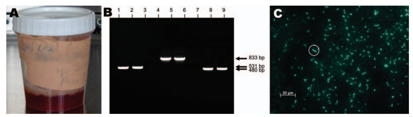
Figure 1. A) Grossly bloody sputum sample obtained from the surviving patient (caregiver B2) 30 h after onset of primary pneumonic plague. B) Polymerase chain reaction results of sputum sample from caregiver B2. Lanes 1–3, caf1 ; lanes 4–6, repA1 ; lanes 7–9, pla . Lanes 1, 4, and 7 are positive controls; lanes 2, 5, and 8 are patient samples; lanes 3, 6, and 9 are negative controls. C) Anti-F1 direct fluorescent antibody staining of sputum sample from caregiver B2. Numerous bacteria with classic halo structures are characteristic of Yersinia pestis . The circled bacterium classically depicts this halo.

Presence of Y. pestis in the surviving patient's sputum was verified by positive PCR results for genes on all 3 of the Y. pestis plasmids (Figure 1B), and DFA showing classic fluorescent staining halos of bacteria with Y. pestis-specific antibody (Figure 1C). Two handheld assays also detected Y. pestis antigen in the sputum. The sputum, which was obtained 1.5 h after her first antimicrobial drug dose, stored overnight without refrigeration, and transported the next day to the central laboratory (6 h in transport), did not yield Y. pestis on bacterial culture. A complete blood count at illness day 20 was within normal limits. Antibody to Y. pestis was not detected in serum from acute-phase blood samples. The patient declined to provide a sample for convalescent-phase serologic testing at a follow-up visit 3 weeks after discharge. The other 3 casepatients were already buried when the outbreak was reported; therefore, autopsies and laboratory verification of their plague diagnoses were not attempted.