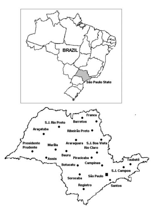
Figure 1. Map of São Paulo State, Brazil, indicating where fecal specimens were collected during the 8-year survey period.

We randomly selected 431 rotavirus-positive samples (55.7%) for determination of G and P genotypes by an RT-PCR assay. G1 was the predominant serotype in these samples (294, 68.2%), followed by G9 (74, 17.2%), G4 (27, 6.3%), G2 (5, 1.2%), G3 (3, 0.7%), mixed infection (8, 1.8%), and untypeable (20, 4.6%) (Table 1). The distribu-