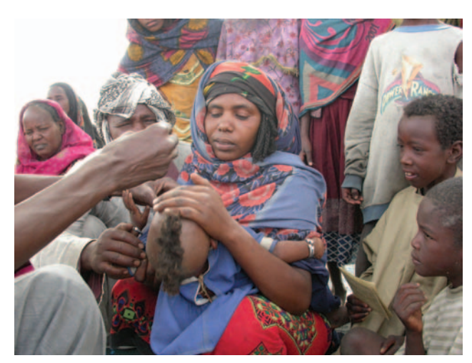
Figure. Polio vaccination of a nomadic child in Chad. While children and woman in the camp received vaccinations by public health workers, the livestock in the camp received vaccinations by veterinarians.

Privatization of veterinary services was initiated in many parts of Africa and Asia as part of a broader effort to improve delivery of animal healthcare in the face of decreasing governmental expenditure and poor public sector performance (25). Numerous incentive schemes were designed to stimulate the privatization process. Subcontracted veterinarians can be effective in the implementation of vaccination campaigns, given that the government subsidizes work in more remote zones. Our analysis on vaccination costs of private veterinarians showed that even with subsidies, income margins of private veterinarians in rural zones for vaccination services (and vaccination being their main activity) were narrow, and most private veterinarians who had started business in rural zones had since withdrawn. Community-based animal health service projects partly fill the gap in chronically underserved rural areas (26). However, to efficiently