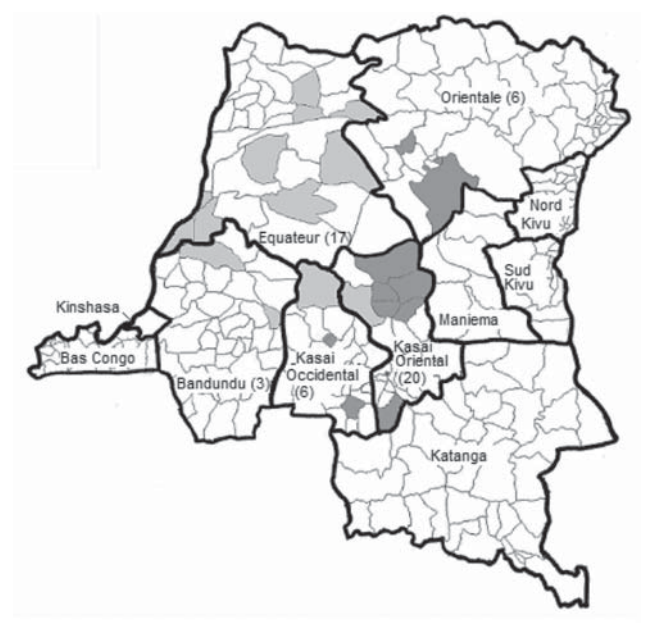
Figure 1. Distribution of 52 confirmed cases of human monkeypox (MPX) by health zone in the Democratic Republic of Congo (DRC), 2001–2004. The cumulative number of cases per province is in parentheses. Confirmed cases of MPX originated from a total of 26 different health zones located in 5 provinces of DRC; most (70.5%) were reported from Kasai Oriental and Equateur Provinces. Two groups can be differentiated on the basis of sequence of the hemagglutinin gene: light gray, group 1; dark gray, group 2. Note: The boundaries of the DRC health zones have since been redrawn. Although the health zones Tshopo and Mweka are not shown (located in provinces Orientale and Kasai Occidental, respectively), the general area is highlighted to represent MPX cases in these regions.

infection in humans because it causes disease clinically indistinguishable from smallpox. Recent outbreaks of MPX in the United States (13), the Republic of Congo (14) and Sudan (15) highlight the capacity of this virus to appear where it has never before been reported. Because clinically, MPX is often confused with chickenpox, laboratory diagnosis is critical to determine whether a suspected case is indeed MPX. In our study, we identified the causative agent for a rash-causing illness in 83% of all patients. We have recently strengthened the MPX surveillance program to improve understanding of the epidemiology of human MPX.