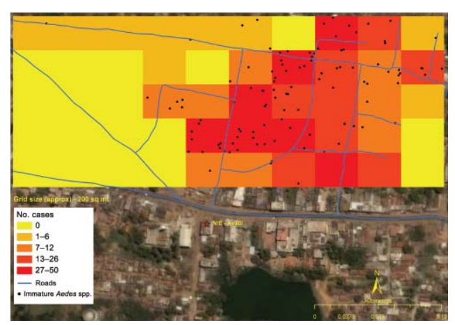
Figure 2. Chikungunya cases and presence of Aedes spp. immature mosquitoes, Gowripet, Avadi, Chennai, Tamil Nadu, India, 2006.

The limitations of our study were the lack of uniform methods for investigating 2 outbreaks and the convenient sampling method used to estimate incidence of subclinical infection. CHIK outbreaks occurred during the peak summer season because of favorable environment for Ae. aegypti mosquitoes in the form of water storage containers that were used in the absence of regular water supply and acute water scarcity. Most of these containers were either uncovered or partially covered and were not cleaned at regular intervals. Thus, a regular water supply that negates the need for water storage, education of the public for safe water storage measures, and environmental control are much needed public health measures to combat future CHIK outbreaks.