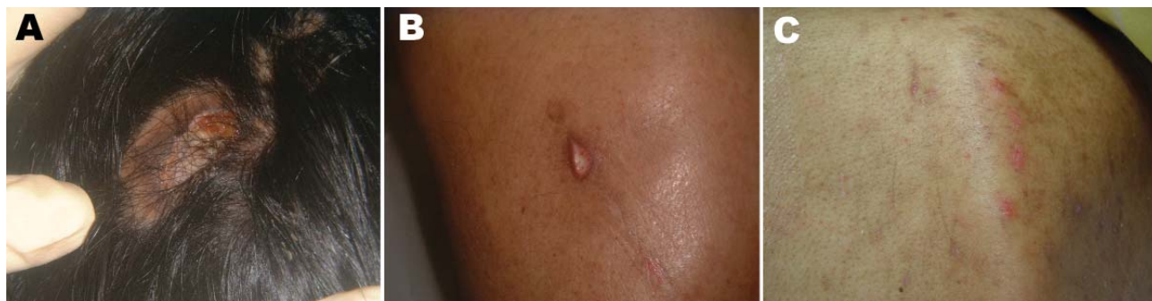
Figure 1. Ulcer with purulent discharge located on the skull (A) and on the back at first examination (B) and 17 days after topical treatment with miltefosine was initiated (C).

TB of lungs, liver, spleen, and kidneys could be achieved, and the CD4 + lymphocyte count increased to 421 cells/ \mu L. Nevertheless, the neurologic status of the patient deteriorated, even after liposomal amphotericin B and flucytosine had been added to the regimen. Consecutive cranial CT and cranial MRI scans demonstrated progression of the lesions, with the biggest lesion (1.8 cm in diameter) located in the right cerebellopontine angle and cerebellum (Figure 2, panels A and B).