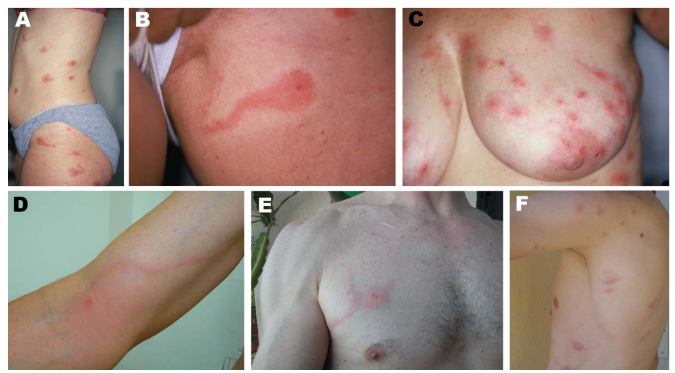
Figure 1. A–F) Photographs of 6 persons with skin lesions of Pyemotes ventricosus dermatitis. Note the central microvesicles, ulcerations or crusts, and some lesions with the comet sign. D) Lymphangitis-like dermatitis. E, F) Lesions resulting from natural infection of 2 of the investigators.

corneal ulceration but no parasite. Skin lesions were examined dermoscopically (magnification \times 40) and showed a microulceration or vesicle in the center of the macule. In contrast, in vivo confocal laser scanning microscopy (CLSM) of a microvesicle from 1 investigator showed an ovoid foreign body with morphologic features suggestive of P. ventricosus (Figure 2, panels C and D).