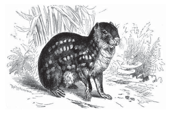
Figure 4. The paca, Cuniculus paca , the natural intermediate host for Echinococcus vogeli and rarely E. oligarthrus . Drawing by Robert Kretschmer (1818–1872).

In just a few years, a second indigenous South American echinococcal species had been discovered, and the life cycle of the parasite, involving the bush dog and the paca, had been described. In a survey of Colombian mammals, 73 (22.5%) of 325 pacas harbored metacestodes of E. vogeli , but only 3 (0.9%) of pacas harbored E. oligarthrus . Twenty (6.2%) more pacas were shown to be infected with polycystic larvae, but the species involved could not be determined. In addition to the bush dog, a domestic dog belonging to a hunter was found to be naturally infected with adult E. vogeli (38). Researchers then assumed that domestic dogs might play a role in the transmission of parasite eggs to humans.