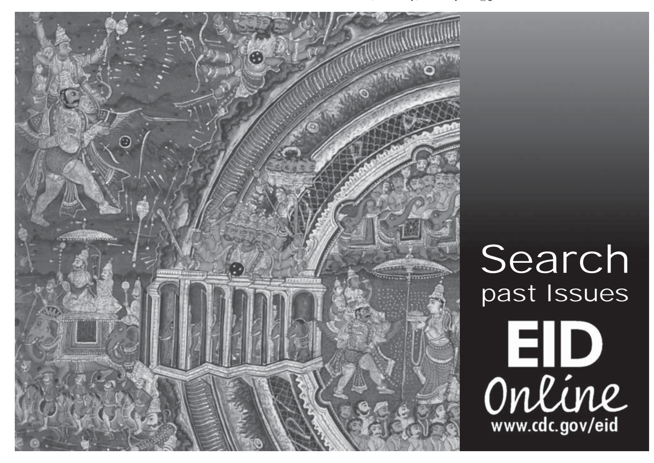
Emerging Infectious Diseases • www.cdc.gov/eid • Vol. 14, No. 2, February 2008