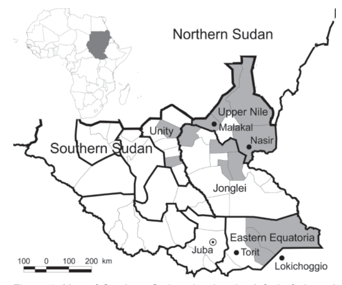
Figure 1. Map of Southern Sudan showing the 2 foci of visceral leishmaniasis. Shaded areas represent those counties where primary cases were reported from January through June 2007. Insert shows location of Sudan in Africa. (Adapted from World Health Organization, Southern Sudan Health Update, July–August 2007.)

These data likely underestimate the actual number of cases because healthcare providers do not always provide complete reports and many kala-azar patients never visit healthcare facilities. Epidemiologic modeling of data from Upper Nile state estimated that those who visited healthcare facilities from October 1998 through May 2002 represented only 55% of cases and that 91% of kala-azar deaths were undetected (8). Health coverage is so minimal that some patients must walk for several days to access even the most basic healthcare services.