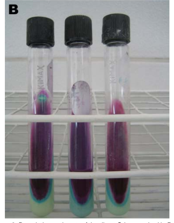
Figure 3. Description and costs of the direct Griess method in Peru. A) Pan-susceptible Mycobacterium tuberculosis isolate. B) M. tuberculosis isolate resistant to isoniazid (INH) and rifampin (RIF). The left (control) tube in panel A and all tubes in panel B indicate mycobacterial growth. The costs of the test are US $5.30 per sample, including personnel, materials (items that can be reused), and supplies (reagents and consumable items), and US $4.80 per sample, including materials and supplies.

tantly, INS trained regional laboratory personnel in DST of first-line line drugs, by the LJ medium proportions method. To initiate rapid DST, the Griess method was validated first at INS; then personnel from each implementing laboratory were trained in the method. Both conventional DST and rapid DST were validated at the regional laboratories. Samples were collected under program conditions. DST was performed by trained personnel in the regional laboratories. These same strains were then sent to INS for validation.