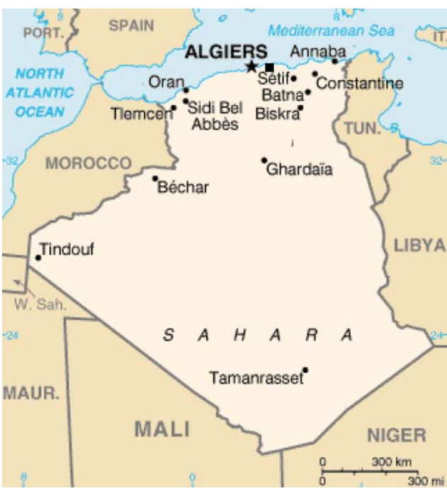
Figure 1. Map of Algeria showing where sandflies were trapped (\blacksquare) .