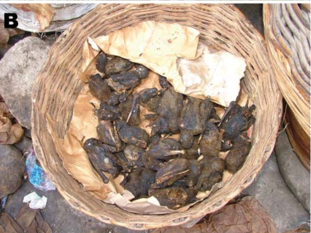
Figure 2. A) Density of a typical Eidolon helvum roost in the Accra colony. B) E. helvum as bushmeat in an Accra market.