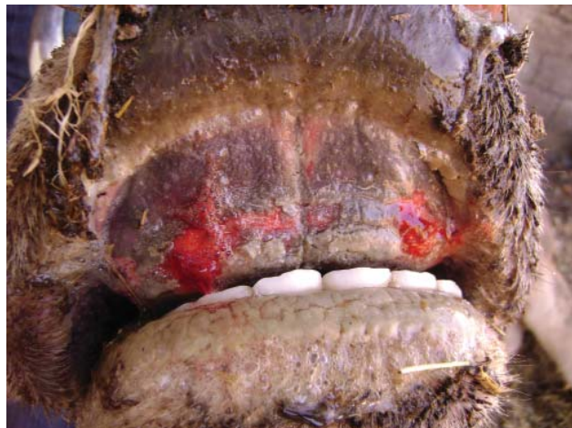
Figure 1. Erosive lesion on pulvinus dentalis of cow seropositive for epizootic hemorrhagic disease virus, Turkey, 2007.

Because EHDV had never been observed in Turkey, no diagnostic procedures were available. We therefore submitted selected samples (11 whole blood samples, 4 serum