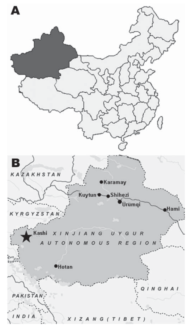
Figure 1. A) Map of China showing location of Xinjiang Uygur Autonomous Region. B) Map of Xinjiang Uygur Autonomous Region showing Kashi region (star), where Tahyna virus XJ0625 was isolated from a pool of Culex spp. mosquitoes.

Mosquitoes were collected in several counties in the Kashi area, Xinjiang Uygur Autonomous Region, China (Figure 1, panel A), from July through August 2006. Mosquitoes were collected in light traps, identified, and sepa-