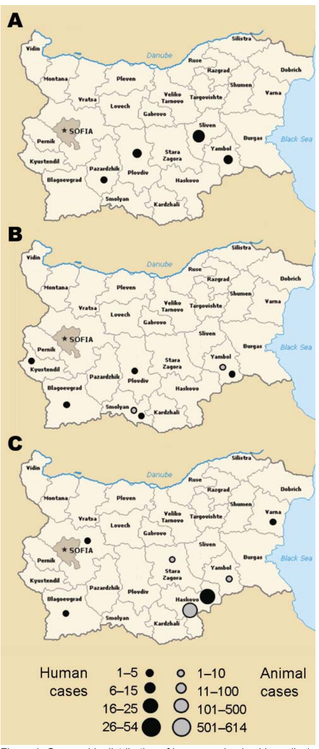
Figure 1. Geographic distribution of human and animal brucellosis in Bulgaria during A) 2005, B) 2006, and C) 2007.

During 2005–2007 (Figure 1), a total of 105 human cases of brucellosis were diagnosed among 2,054 persons