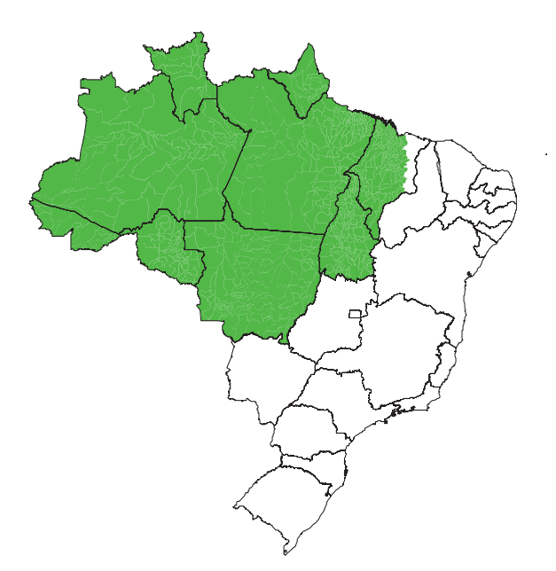
Figure 1. Map of Brazil showing the Amazon region (green).

For the resident population >10 years of age, a detailed analysis of the proportion of cases with missing data for education level (Figure 2) showed large reductions in leishmaniasis, leprosy, and tuberculosis over the period of eval-