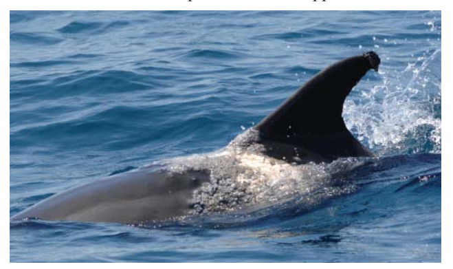
Figure 2. Free-swimming bottlenose dolphin (offshore ecotype) sighted off the Outer Banks of North Carolina with raised gray to white nodules over the dorsal surface, consistent with those of lobomycosis seen in other Atlantic bottlenose dolphins. Xenobalanus sp., a barnacle, is adhered to the tip of the dorsal fin.

Because L. loboi has not been cultured, molecular techniques have been used to characterize the fungus. It is most related to the fungal order Onygenales, which includes Emmonsia spp. and Paracoccioidies spp. There are limited DNA sequences from Lacazia spp. for comparison, and PCR results for suspected Lacazia spp. are similar to