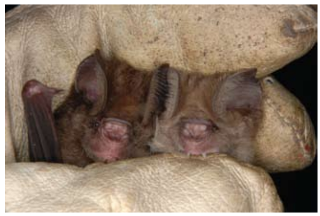
Figure 2. Two morphotypes of Hipposideros caffer ruber , held by one of the authors (F.G.-R.), who was wearing a leather glove.

an 817-nt fragment for phylogenetic analysis. All methods of phylogenetic inference placed this virus next to a common ancestor with human coronavirus 229E, which circulates worldwide in humans (Figure 3). Bootstrap support of the hCoV-229E/GhanaBt-CoVGrpI root point in neighbor-