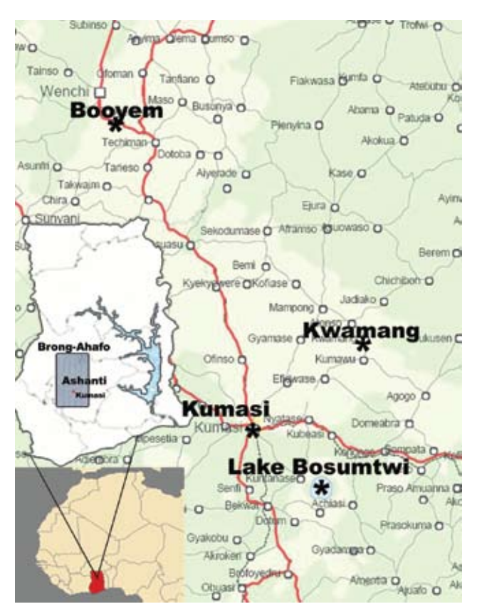
Figure 1. Location of Kwamang caves near the village of Kwamang, (6°58′N, 1°16″W), 50 km northeast of Kumasi, Ashanti region, Ghana. Booyem caves A (7°43′24.9″N, 1°59′16.5″W) and B (7°43′25.7″N, 1°59′33.5″W) are located near remote small settlements in the vicinity of Booyem, Brong-Ahafo region. Lake Bosumtwi is located 30 km southeast of Kumasi (6°32′22.3″N, 1°24′41.5″W). The botanical gardens of Kwame Nkrumah National University of Science and Technology are located on campus in the city of Kumasi (6°41′6.4″N, 1°33′42.8″W). Kumasi Zoo is located in the center of the city (6°42′2.0″N, 1°37′29.9″W).

Nucleic acid alignments were conducted based on amino acid code by using the ClustalW algorithm (www. ebi.ac.uk/clustalw) in the Molecular Evolutionary Genetics Analysis version 4.0 software package (www.megasoftware.net) (19). Two gap-free nucleotide alignments (817 bp and 1,221 bp) were generated. Tree topologies were determined on both datasets by using MrBayes version 3.1 (20). The analysis used a general time reversible (GTR) substitution model, with 6 rate categories to approximate a gamma-shaped rate distribution across sites and an invariant site assumption (GTR + \Gamma 6 + I). Markov chain Monte Carlo (MCMC) chains of 10^7 iterations were sampled every 500 generations, resulting in 20,000 sampled trees. Two