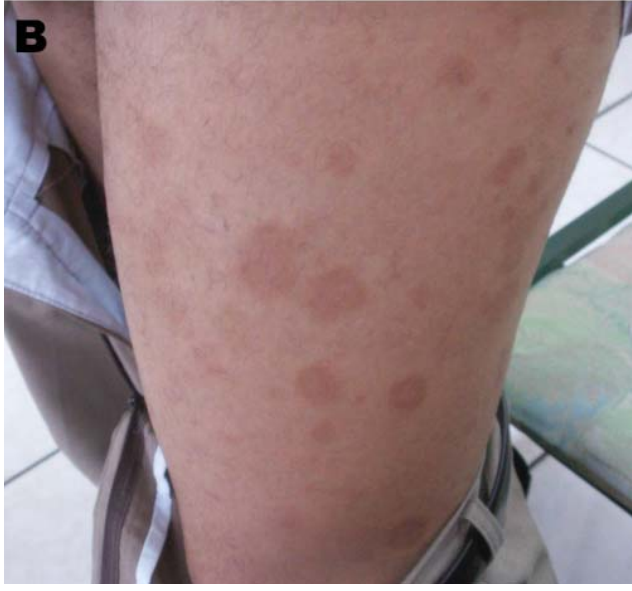
Figure 1. Erythema migrans—like rash on the left leg of a 28-year-old patient. A) Characteristic rash of erythema migrans (annular macular lesion that is erythematous with central clearing). B) Spread of the lesions to the rest of the leg.