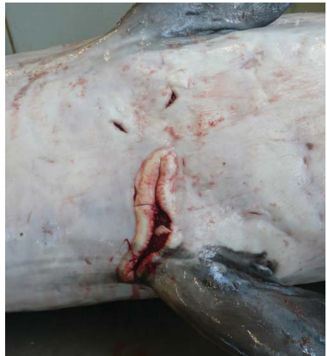
Figure 1. Longitudinal skin ulcer between flippers of a harbor porpoise ( Phocoena phocoena ) with Brucella ceti infection, Belgium, 2008.

in milk (as in the present study) and in fetal tissues and secretions of a pregnant dolphin suggest that B. ceti has tropism for placental and fetal tissues and that it can be shed externally (4). This finding suggests potential vertical and horizontal transmission to newborns (4). Nevertheless, indirect transmission through parasites should not be excluded because Brucella spp. have been identified from