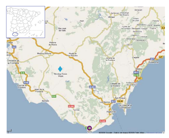
Figure 2. Epidemiologic situation for bluetongue virus (BTV) in Spain, July–August 2007. The first BTV-1 case in Spain was reported in Tarifa (purple circle), only 60 km west from a deer farm where the samples were collected (blue diamond).

Regarding EHD, despite the negative results obtained, lack of robust molecular tools for its detection is noteworthy. All available RT-PCRs are based on the sequences of EHD strains that have never been detected in the Mediterranean area.