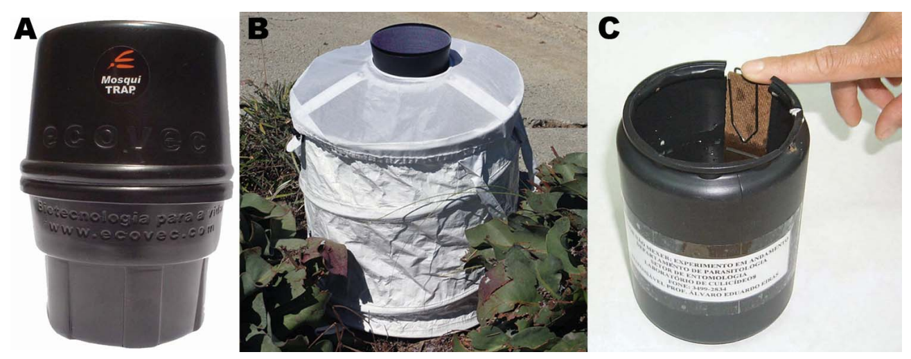
Figure 1. MosquiTRAP version 2.0 (Ecovec Ltd., Belo Horizonte, Brazil) (A), BG-Sentinel trap (Biogents, Regensburg, Germany) (B), and an ovitrap (C) used for obtaining mosquitoes in the northwestern borough of Belo Horizonte, Minas Gerais, Brazil.

pe, AZ, USA) with 1,000 bootstrap replicates. These sequences have been deposited in GenBank (accession nos. GQ330909–11 and GU588695–8).