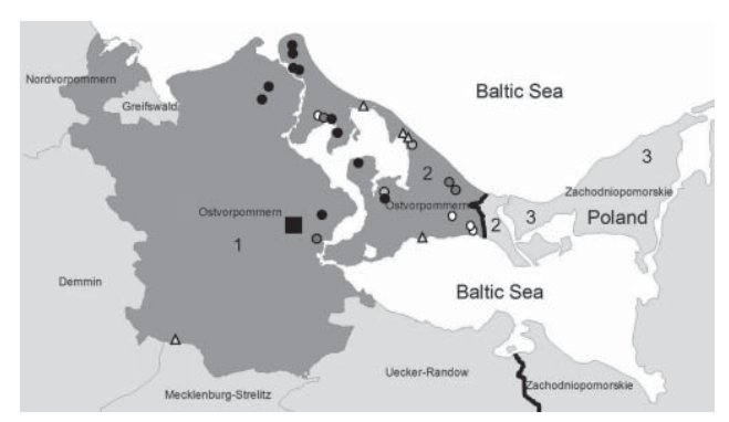
Figure 2. Region in Germany and Poland investigated for Trichinella spp. 1, Ostvorpommern, Germany; 2, Usedom Island, Germany; 3, Wolin Island, Poland. Triangles, Trichinella spp.–positive cases in raccoon dogs; circles, cases in wild boars; square, location of outbreak farm; white circles and triangles, cases in 2005; light gray circles, cases in 2006; dark gray circles, cases in 2007; black circles, cases in 2008.

The optimal habitat for raccoon dogs is wet areas and fields, small forests, and large ditches bordered by thick