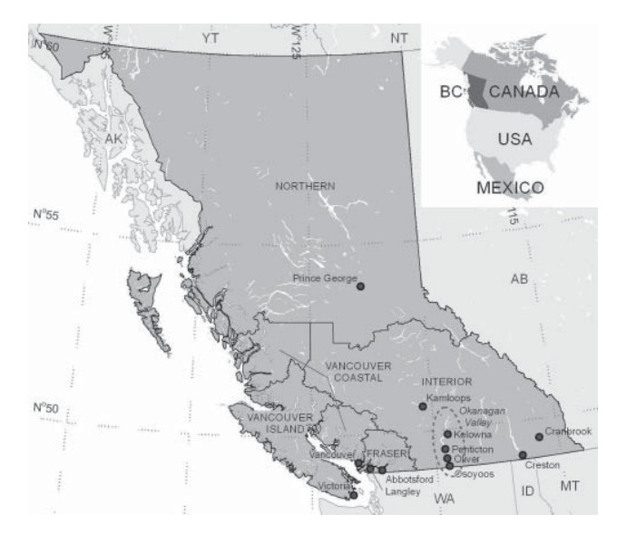
Figure 1. Select cities (lower case) in British Columbia, Canada, and regional health authorities (upper case). Each regional health authority undertakes West Nile Virus surveillance under the guidance and recommendations of the British Columbia Centre for Disease Control. The dashed oval encompasses the Okanagan Valley, which was the primary focal point of West Nile Virus activity in British Columbia during 2009. WA, Washington, USA; ID, Idaho, USA; MT, Montana, USA.

The British Columbia Centre for Disease Control (BC-CDC) and the BCCDC Public Health Microbiology and Reference Laboratory (PHMRL), in partnership with regional health authorities, municipalities, and regional governments, have conducted human surveillance, mosquito sampling, and dead corvid surveillance and testing since 2003. During the WNV seasons of 2003-2007, mosquito surveillance covered the southern extent of the province and extended as far north as 55°N latitude. However, in response to the prolonged absence of the virus, mosquito surveillance was reduced in 2008; mosquito traps were placed only at or below 50°N latitude (Table 1; Figure 1). An additional 16 traps were placed in the southern Okanagan Valley in 2009 as part of a research project to supplement the 91 traps operated by the province, effectively acting as targeted surveillance in this area. CDC light traps (Model 512; John W. Hock Company, Gainsville, FL, USA) baited