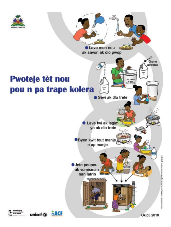
Figure 3. Educational poster (in Haitian Creole) used by the Haitian Ministère de la Santé Publique et de la Population (MSPP) to graphically present the ways of preventing cholera. DINEPA, Direction Nationale de l'Eau Potable et d'Assainessement; UNICEF, United Nations Children's Fund; ACF, Action Contre la Faim.

To increase access to treated water and raise awareness of ways to prevent cholera, a consortium of involved NGOs and agencies, called the water, sanitation, and hygiene cluster, met weekly. Led by Haiti's National Department of Drinking Water and Sanitation and the United Nation's Children's Fund, the members of this cluster targeted all piped water supplies for chlorination and began distributing water purifying tablets for use in homes throughout Haiti. CDC helped the National Department of Drinking Water and Sanitation monitor these early efforts with qualitative and quantitative assessments of knowledge, attitudes,