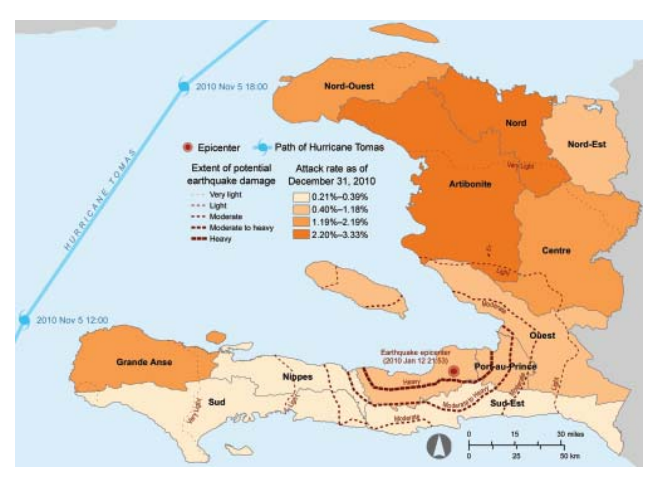
Figure 1. Administrative departments of Haiti affected by the earthquake of January 12, 2010; the path of Hurricane Tomas, November 5–6, 2010; and cumulative cholera incidence by department as of December 28, 2010.

water purification tablets and to teach the population how to use them. Although most of the population had heard messages about treating their drinking water, many lacked the means to do so.