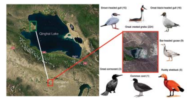
Figure 1. Location in Qinghai, China, of dead birds that were tested for avian influenza virus (H5N1), with images and common names of bird species tested. Red box indicates Gengahai Lake, where dead birds were detected, and green box indicates Bird Islet of Qinghai Lake; the distance between them is 90 km. Numbers of dead birds of each species are indicated in parentheses.

To determine the pathogenesis of this outbreak, we obtained organs, including lung and brain, and cloacal swabs from 13 birds at different times. Tissue samples were inoculated into 10-day-old, embryonated, specific pathogen—free eggs for virus isolation. Hemagglutinin and neuraminidase subtypes were determined as described (9). Eleven avian influenza viruses (H5N1) were isolated from 3 species of wild birds: 4 from great crested grebes, 5 from great blackheaded gulls, and 2 from brown-headed gulls. Results of virus isolation for samples from a bar-headed goose and a shelduck were negative. Samples from great cormorants and a common coot were not obtained and tested.