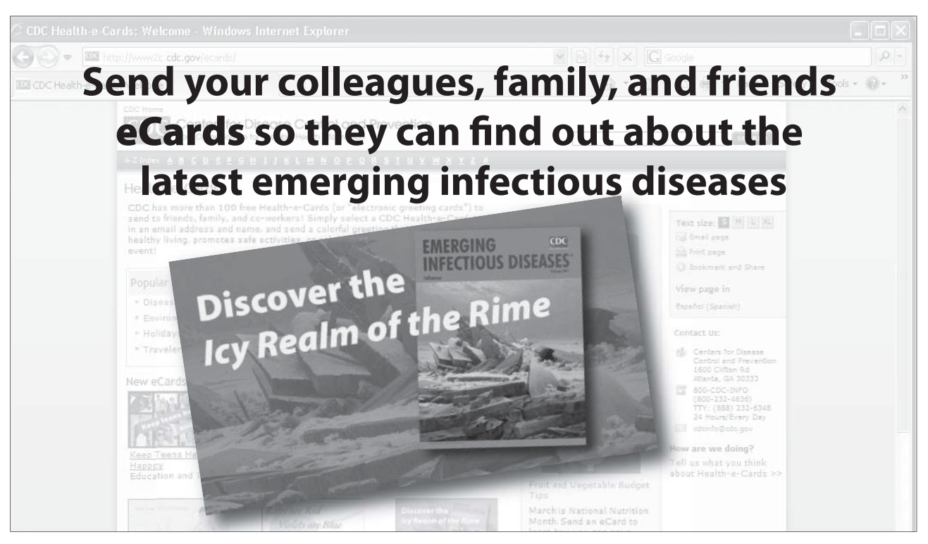
Emerging Infectious Diseases • www.cdc.gov/eid • Vol. 17, No. 7, July 2011