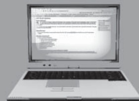
Table of contents Podcasts Ahead of Print Medscape CME Specialized topics