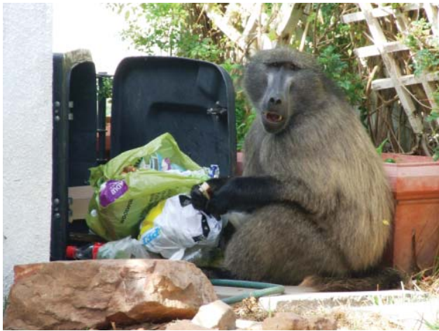
Figure 2. Baboon raiding a dustbin in the residential suburbs of Cape Town, South Africa.

baboon population to inform decisions relating to baboon management, welfare and conservation, and the health risk to local humans and baboons. Ethical approval was gained from the Royal Veterinary College Ethics and Welfare Committee.