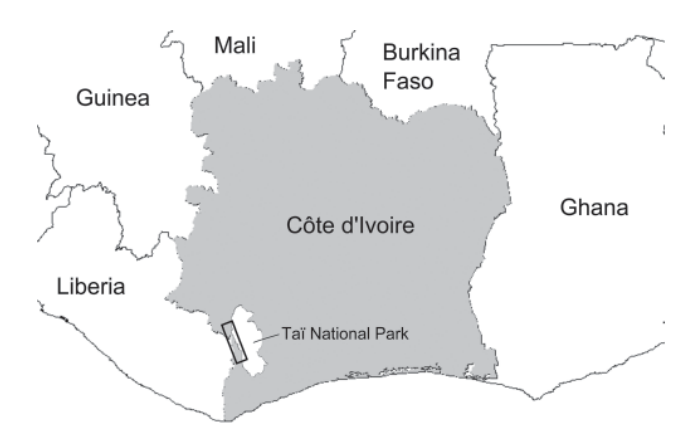
Figure 1. Sampling zone in study of the origin of human Tlymphotropic virus type 1 in rural western Africa, 2006–2007. Taï National Park is indicated in white on the gray background of Côte d'Ivoire. The black rectangle overlapping Taï National Park defines a zone encompassing the 18 villages where study participants resided. Village names and the number of participants are as follows: Daobly (38), Djereoula (31), Djiboulay (40), Gahably (55), Gouléako (37), Goulégui-Béoué (55), Kéibly (90), Pauléoula (20), Ponan (21), Port-Gentil (47), Sakré (75), Sioblooula (35), Taï (26), Tieleoula (40), Zagné (17), Zaïpobly (37), Ziriglo (74).

(Figure 2) and env tree topology (online Technical Appendix Figure). Six of the newly determined HTLV-1 sequences were unambiguously related to HTLV-1A (bootstrap, 94; posterior probabilities, 1) (Figure 2), confirming the predominance of this molecular subtype in Côte d'Ivoire and in western Africa (6). Another 3 HTLV-1 sequences were closely related to STLV-1 sequences found in sooty mangabeys ( Cercocebus atys ) from Taï National Park (bootstrap, 83; posterior probabilities, 1) (Figure 2; online Technical Appendix Table 2), whereas the last 1 was related to STLV-1 sequences from red colobus monkeys ( Piliocolobus badius badius ) and chimpanzees ( Pan troglodytes verus ) from Taï National Park (bootstrap,