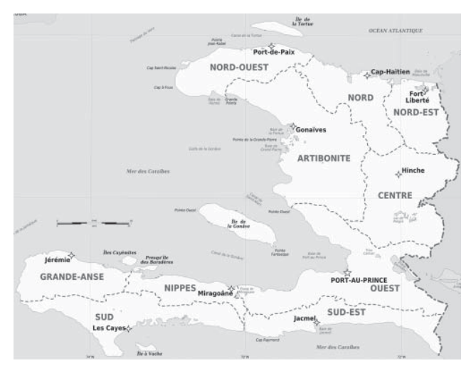
Figure 2. Departments of Haiti.

probably because of the higher number of aid workers and visitors and increased P. falciparum malaria transmission. Data suggest that the earthquake and ensuing hurricane and floods created the necessary conditions-inadequate shelters, population movement, and still water-to increase the incidence of malaria and possibly spread the recently identified chloroquine-resistant strains of P. falciparum (10). In France and Canada, laboratory surveillance for malaria found that 2 travelers from Haiti carried chloroquine-resistant strains. In vitro culture might have selected resistant strains not observed initially by ex vivo methods. After carefully interviewing these patients about their travels, we found no evidence to cause doubt that they had acquired malaria in Haiti. Alternatively, the resistant strains could have come to Haiti after the earthquake through human activity, as occurred in the cholera outbreak (13).