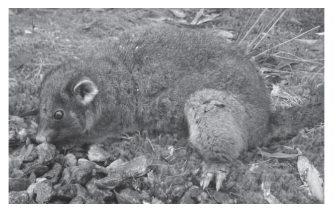
Figure 1. Ringtail possum ( Pseudocheirus peregrinus ) as photographed by its bite victim, Tasmania, Australia, 2011.

In the reference laboratory, the 16S rRNA gene was amplified from the axillary aspirate by using primers targeting the U1, U3, and U5 regions. The resulting 1,331-bp amplicon (GenBank accession no. JQ277265) demonstrated 100% homology with 16S rRNA gene sequences from F. tularensis ssp. tularensis and holarctica stored in GenBank. PCR and sequencing of the recA gene (3) confirmed F. tularensis (GenBank accession no. JQ277266). Amplicons of 16S rRNA and recA genes were aligned with reference sequences from the GenBank/ European Molecular Biology Laboratory/DNA DataBank of Japan databases and with sequences from 2 previous Francisella spp. reported from Australia (4). The 16S rRNA and recA gene sequences showed 100% query