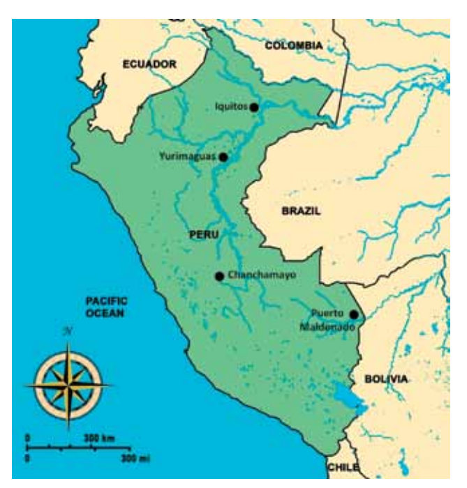
Figure 1. Map of Peru. Sites for study of Mayaro virus-infected patients are marked with a dot.

Besides fever, the most common symptoms affecting participants in the acute stage of MAYV infection were malaise, headache, arthralgia, myalgia, and retro-orbital pain. The prevalence of these and other nonjoint signs and symptoms at the acute-phase and follow-up visits are available in the online Technical Appendix Table, wwwnc.cdc. gov/EID/articlepdfs/19/11/13-0777-Techapp1.pdf.