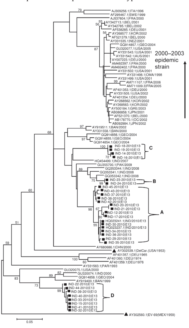
Figure. Phylogenetic tree based on alignments of partial viral protein 1 gene sequences of echovirus 13 (E13) constructed by the neighbor-joining method implemented in MEGA version 5.05 software (7) by using the Kimura-2 parameter nucleotide substitution model. Bootstrap analysis included 1,000 pseudoreplicate datasets. Clusters are labeled A, B, C, and D. Square indicates Uttar Pradesh E13 from fecal samples. All Uttar Pradesh E13 isolates on the tree are identified by using the same numbers listed in Table 1. Triangle indicates E13 prototype Del Carmen and the out-group enterovirus 69. Scale bar indicates nucleotide substitutions per site.

EVs (3,8). Nonpolio HEVs also have been detected in epidemics of paralytic disease (9). Although nonpolio HEVs can be isolated from asymptomatic children, few studies have compared the nonpolio HEV serotypes found in AFP