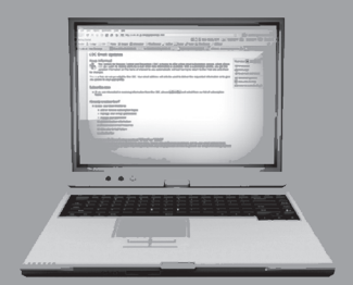
Table of contents Podcasts Ahead of Print Medscape CME Specialized topics