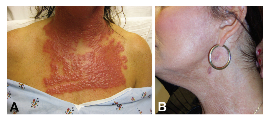
Figure 1. A) Neck and chest of a 53-year-old woman (case-patient 1) 14 days after fractionated CO_2 laser resurfacing. B) Neck of the patient after 5 months of multidrug therapy and pulsed dye laser treatment.

fluconazole, doxycycline, and valacyclovir for presumed fungal, staphylococcal, or disseminated herpes simplex virus infection. Because of extensive pruritus, the patient was given locoid lipocin (0.1% hydrocortisone butyrate) and a tapered dose of prednisone for possible allergic contact dermatitis. She reported adherence to instructions to avoid showering and washing her face with tap water for 72 h after the procedure. However, she was exposed to dust from sanding she did at home during the week after the procedure. She did not show improvement over the next 2 days and, after a low-grade fever developed, was hospitalized and received intravenous acyclovir therapy for presumed disseminated herpes simplex virus infection.