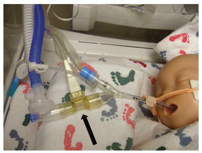
Figure 2. Draeger Evita v500 respirator. Arrow indicates Neoflow air flow sensor.

MLST was performed for 8 B. cereus isolates from case-patients and for 1 environmental isolate from the air flow sensor. We were able to fully characterize 4 of the 9 isolates (Table). One locus for the remaining 5 strains did not yield an amplicon for sequencing after repeated attempts and, thus, could not be assigned a sequence type. The isolates that included sequence type (ST) 73 and ST94 were closely related to each other because they differed by merely 1 locus, gmk. The strains that were not fully typed because of the inability to obtain sequences for locus pta were also closely related to ST73 or ST94 because the other loci matched. There was 1 match between strains isolated from 1 case-patient and the air flow sensor, which was ST73. The contaminated air flow sensor was then sterilized by using a steam autoclave. A repeat culture of this sensor after sterilization was negative.